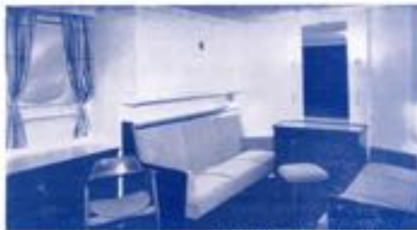
CABIN 9-151 — OUTSIDE — WITH PRIVATE SHOWER AND TOILET